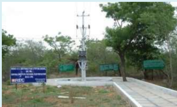
Demo HVDS System

Indoor games like Table Tennis, Chess and Caroms are available. Jogging Track of 1 km length, Badminton court and mini Gym are also available.