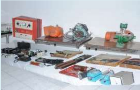
Distribution systems Laboratory

RECIPMT has developed an Energy Park equipped with 40kwp Rooftop Solar PV System, 1kwp Solar Street Lights, 5kwp Solar Water Pumping System and HVDS Resource Centre along with HVDS System for demonstration.