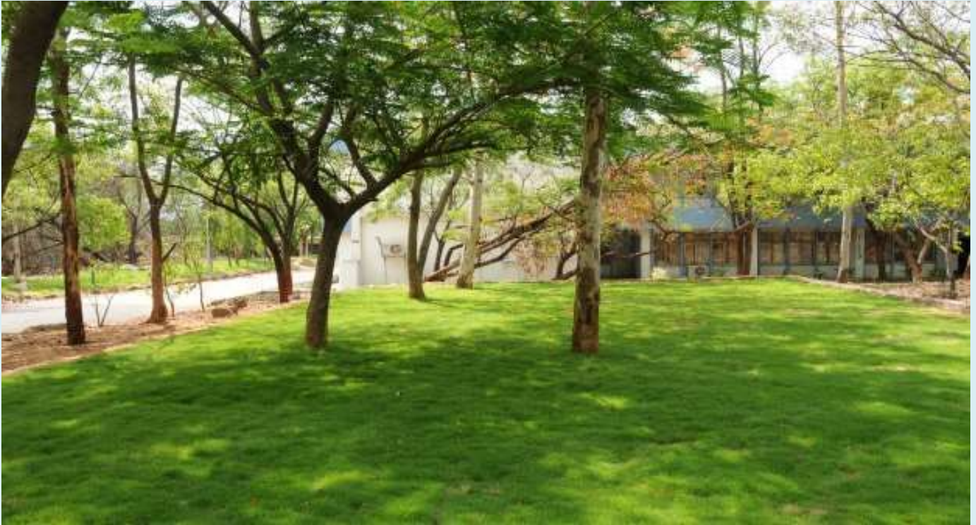
Landscape-on way to Hostel