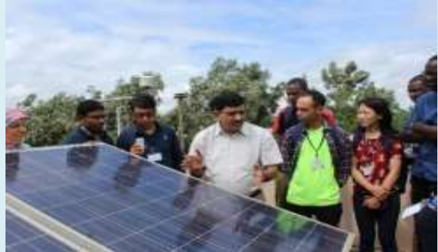
Roof-Top Solar PV System