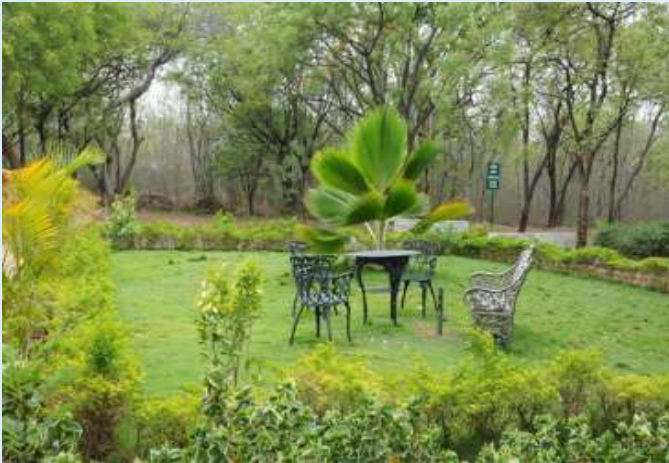
Landscape - Hostel

It is located on the National Highway No.44, at Aramgarh X Roads, Shivarampally, Hyderabad which is about 16 Kms away from the new Rajiv Gandhi International Airport, Shamshabad.