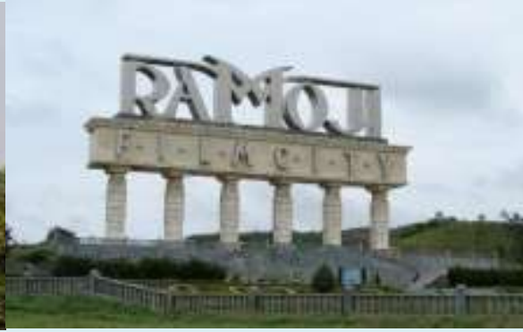
Ramoji Film City

Hyderabad, the capital of Telangana State, is a picturesque sprawling city located about 1700 kms south of New Delhi, India's capital and nearly 800 kms to east of Mumbai, the business capital of India. It is situated at an elevation of 540 meters above the sea level and enjoys pleasant climate almost throughout the year. The City has many majestic historical monuments, mosques and marvelous minarets and palaces. The world famous monument Charminar – an imposing structure with 53 meters high – is an attraction of the city. On the western outskirts of the city, the historical Golconda Fort is located. The Salar Jung Museum, the world's largest oneman collection, displays around 35,000 antiques and art objects.